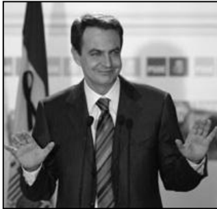
"we are making a more decent society."